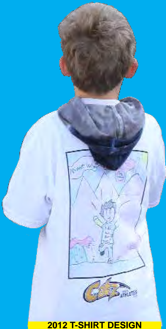
2012 T-SHIRT DESIGN

For more information contact the Community Services Office 626.355.5278